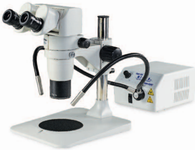
▲ Z10 Pole Stand with MI-LED Dual Gooseneck Illuminator

A wide range of stands and illumination options are available to meet the needs of any application. UNITRON offers plain focusing stands, LED stands, boom stands, articulating (flex) arm stands, pole stands, diascopic illumination stands, along with a variety of LED ring lights and fiber optic illuminators.