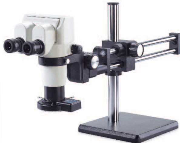
▲ UNITRON Z10 Series Ergo Ball Bearing Stand with LED Ring Light