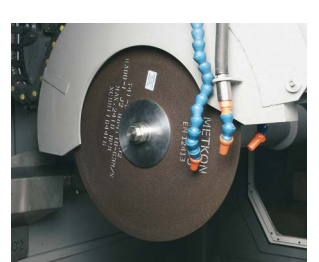
Automatic Wheel Measurement

The Central Lubrication System is optionally available to minimize maintenance and shutdowns. The system optimizes the amount of lubrication to the machine components and supplies lubrication only when it is needed, thus reducing the amount of lube required for the machine, and limiting the chance of excess lube contaminating the coolant.