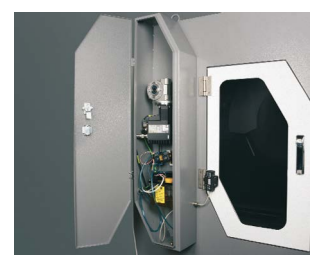
Central Lubrication System