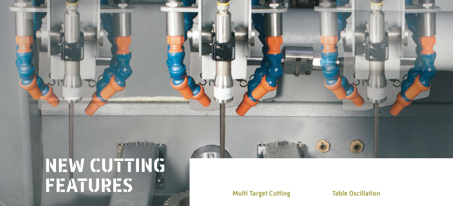
Multi Target Cutting

Several clamped specimens can be cut in one step. Same or different cutting parameters can be set for each specimen. Cut off wheel moves to the predefined start position automatically for rapid and fast positioning