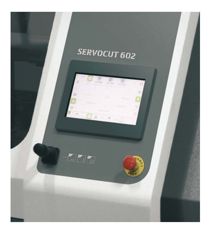
HMI touch screen controls with various cutting methods and database with cutting programs and maintenance monitoring