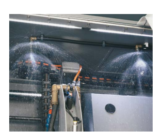
Auto Clean Function